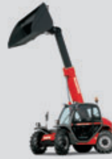
MT 523/MLT 523 T