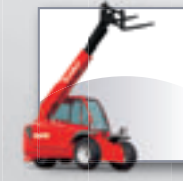
Twisco Compact telescopic handler