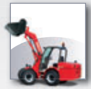
MANILOADER Articulated wheeled loaders