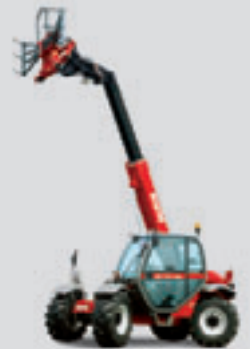
MLT 627 T 20"/24"