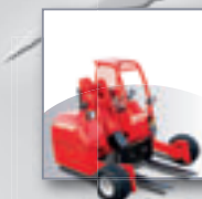
MANITRANSIT Truck mounted forklifts