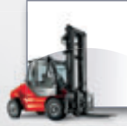
MANITOU Rough terrain and semi industrial masted trucks