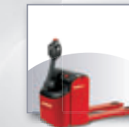
MANILEC Electric pallet trucks and electric stackers