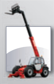
MANISCOPIC Telescopic trucks

Inventor of the rough terrain forklift truck, Manitou offers today the most comprehensive range to meet all specific handling and personal lifting requirements :