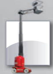
MANIACCESS Access equipment