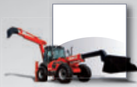
MANIHOE Backhoe/Loader with telescopic boom